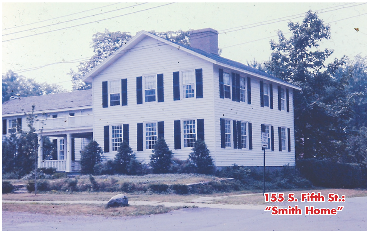
155 S. Fifth St.: "Smith Home"

Over the next six months, the Historical Association of Lewiston and Lewiston Bicentennial Committee will team with Niagara Frontier Publications to highlight news, events and features commemorating Lewiston's first 200 years. These exclusive pieces will count down to a grand celebration, scheduled July 1-4, 2022.